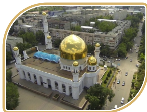
CENTRAL MOSQUE, IN THE CITY