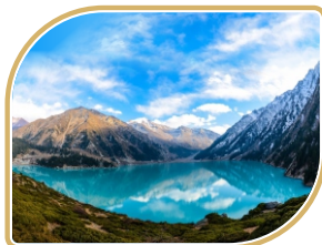
BIG ALMATY LAKE, 1 st FROM ALMATY