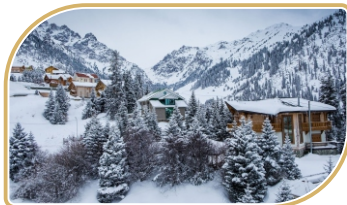
CHYMBULAK SKI RESORT, 20 MIN FROM ALMATY BY CAR