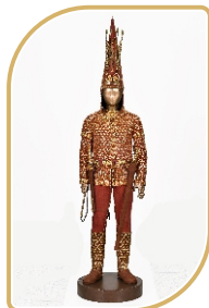
GOLDEN MAN MEMORIAL, ISSYK REGION, 2 nd FROM ALMATY