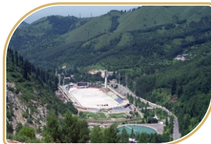
HIGH ALTITUDE SKATING RING MEDEU