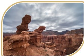
CHARYN CANYON, 3 rd FROM ALMATY